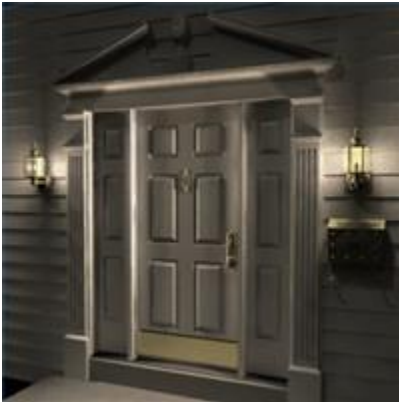
Doorknob and Kickplate

Updating the look of the exterior of your home can be as simple as changing the hardware to your front door.